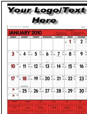
Red & Black