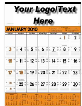
Orange & Black