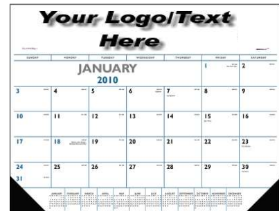
Red & Black or Blue & Black