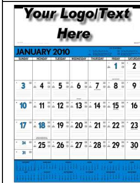
Blue & Black