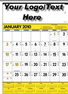
Yellow & Black