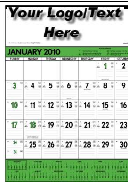
Green & Black